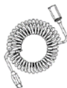
Extension Cord (x 1)