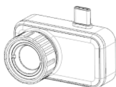
Thermal Imager (×1)